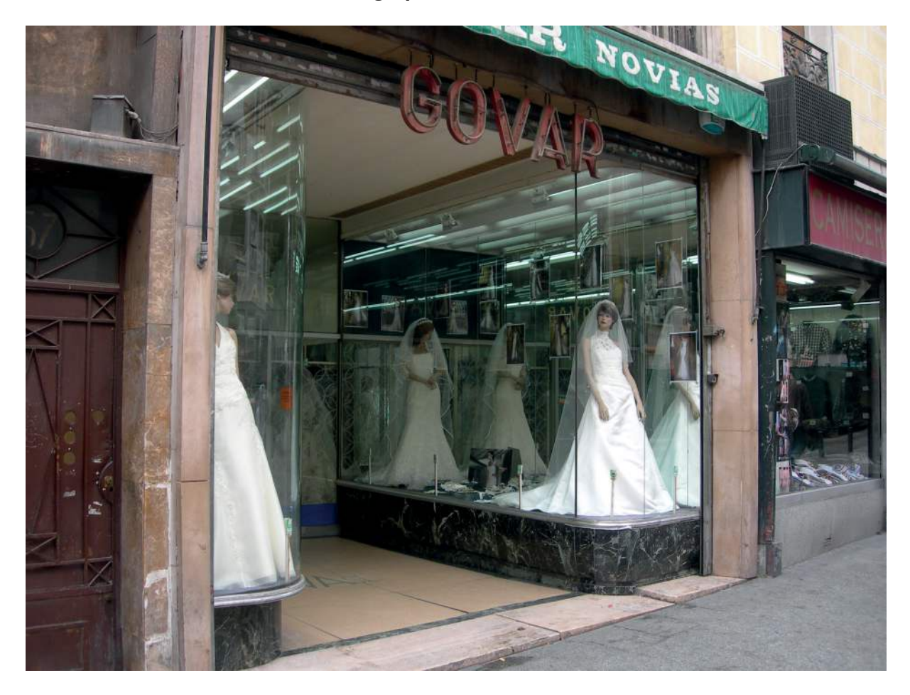
Photograph C for Question 2